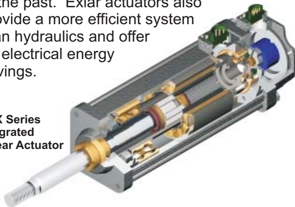
GSX Series Integrated Linear Actuator

By eliminating the need for oil, Exlar's electro-mechanical actuators also provide an environmentally friendly solution. Oil leaks and the associated maintenance are a thing of the past. Exlar actuators also provide a more efficient system than hydraulics and offer an electrical energy savings.